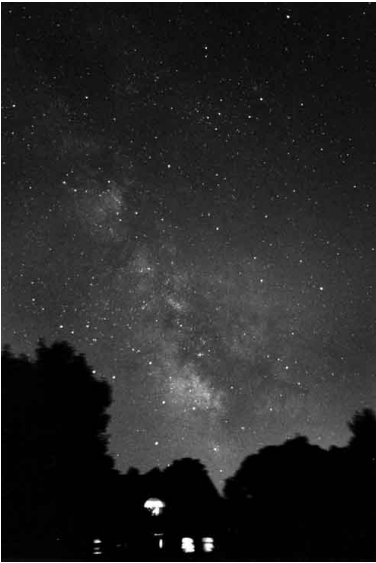
Night sky as seen without light pollution.

Quality lighting is the key. Let's put light to work for us rather than wasting it.