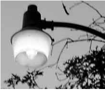
Change this dusk to dawn fixture to...

Add a shield to existing spotlights and floodlights. Light shields will direct the light toward the ground. Shielded light fixtures use energy more effectively and efficiently, reduce hazardous and annoying glare, prevent unwanted light trespass onto neighboring properties and lessen sky glow, which obliterates our view of the stars.