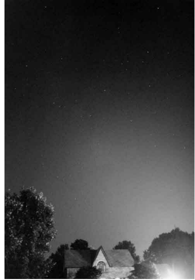
Photograph taken in same area with lights on. Sky glow and glare block out our view of the stars.