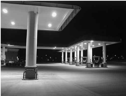
An example of good gas station lighting.

Appropriate lighting for service stations and parking areas should be no more than ten times the illumination level of the surrounding area. Glare can be reduced by using fixtures that are completely recessed up into the pumping island canopy. Lighting fixtures serving parking areas should be using fully cut off fixtures. Preferred light sources are High Pressure Sodium (HPS) and Metal Halide (MH) in the appropriate wattage.