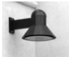
one that is pointed downward.