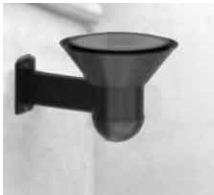
Change this upward pointed light to ...

Point lights downward. Installation and positioning are very important. Place fixtures under overhangs when possible. Any fixture positioned too high can splash light far beyond the boundaries of the targeted area. The perfect scenario is uniformity of light over the illuminated area while minimizing the light trespass.